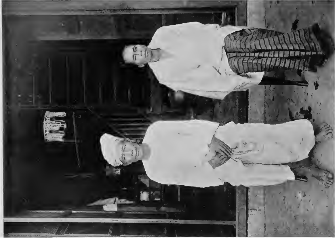
An Elderly Burmese Couple